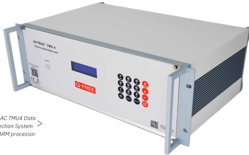
HI-TRAC TMU4 Data Collection System > with ARM processor

HIGHLY ACCURATE HIGH-SPEED WEIGH-IN-MOTION & CLASSIFICATION SYSTEM